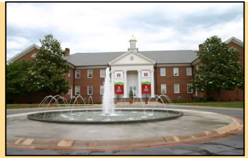
USC Upstate has been providing graduate programs in education since 1996.

Graduate Programs School of Education 800 University Way Spartanburg, SC 29303